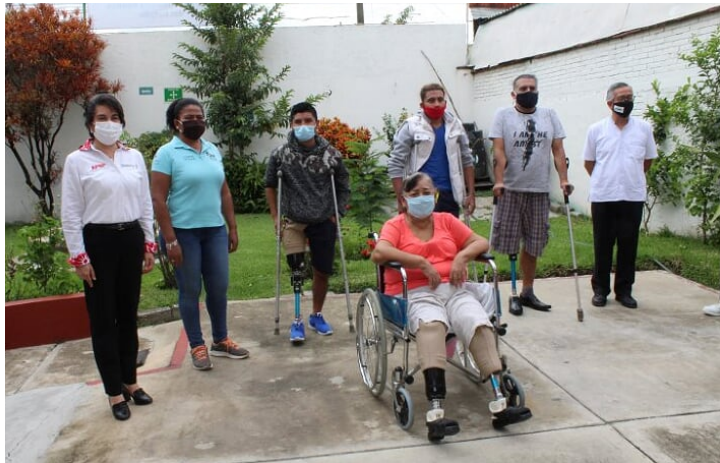
Amputees from Oaxaca, Mexico who received a LIMBS prosthetic leg in the month of August 2020 .

During August and September 2020, LIMBS is proud to announce 123 prosthetic legs have been provided to amputees in Mexico, Indonesia and Bangladesh.